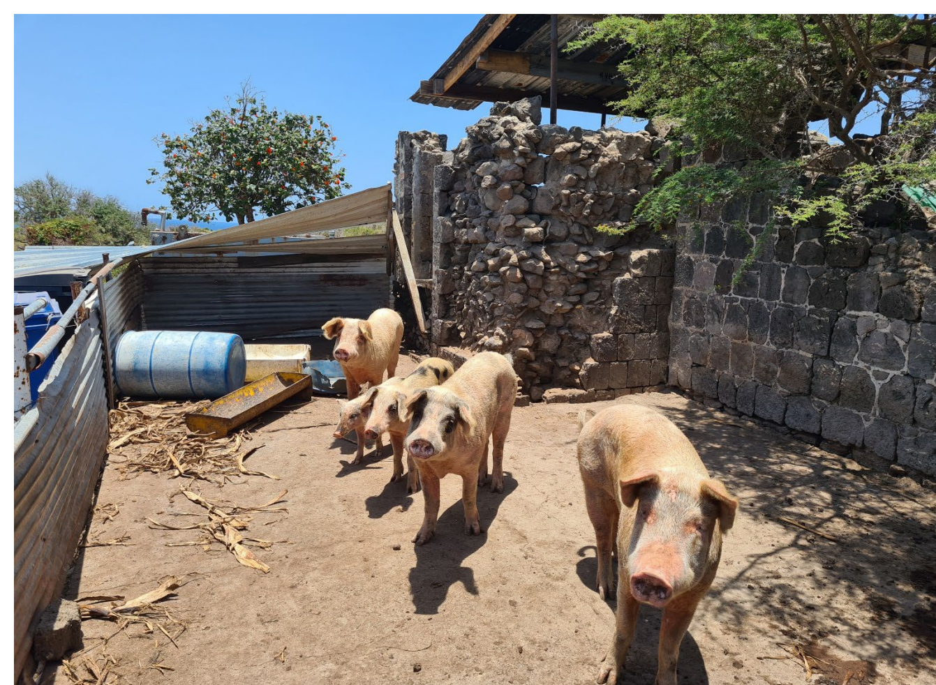
Figure 2. Small scale agricultural production.

The hospitality sector (e.g. diving and ecotourism without mass-tourism) which is partly responsible for the pressure on the environment, occupies an intermediate position in terms of employment. Agriculture (e.g. overgrazing) and fisheries (overfishing) which are associated with significant pressures for the ecosystem are relatively unimportant to the economy of St. Eustatius.