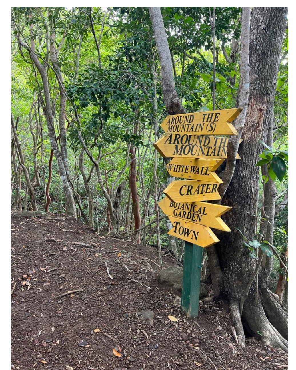
Figure 5. Nature walks