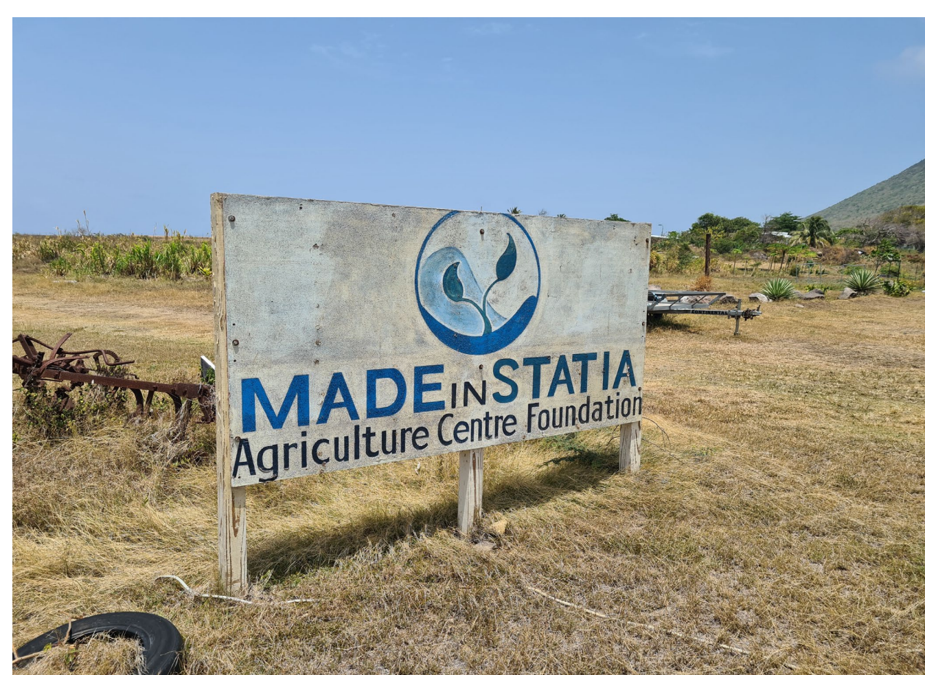
Figure 1. Local non-governmental organizations are involved from the start.

This project will be implemented in very close collaboration with local staff, with local authorities and the broader community. The project group is coupled to business at St Eustatius with an interest to continue implementation after project end.