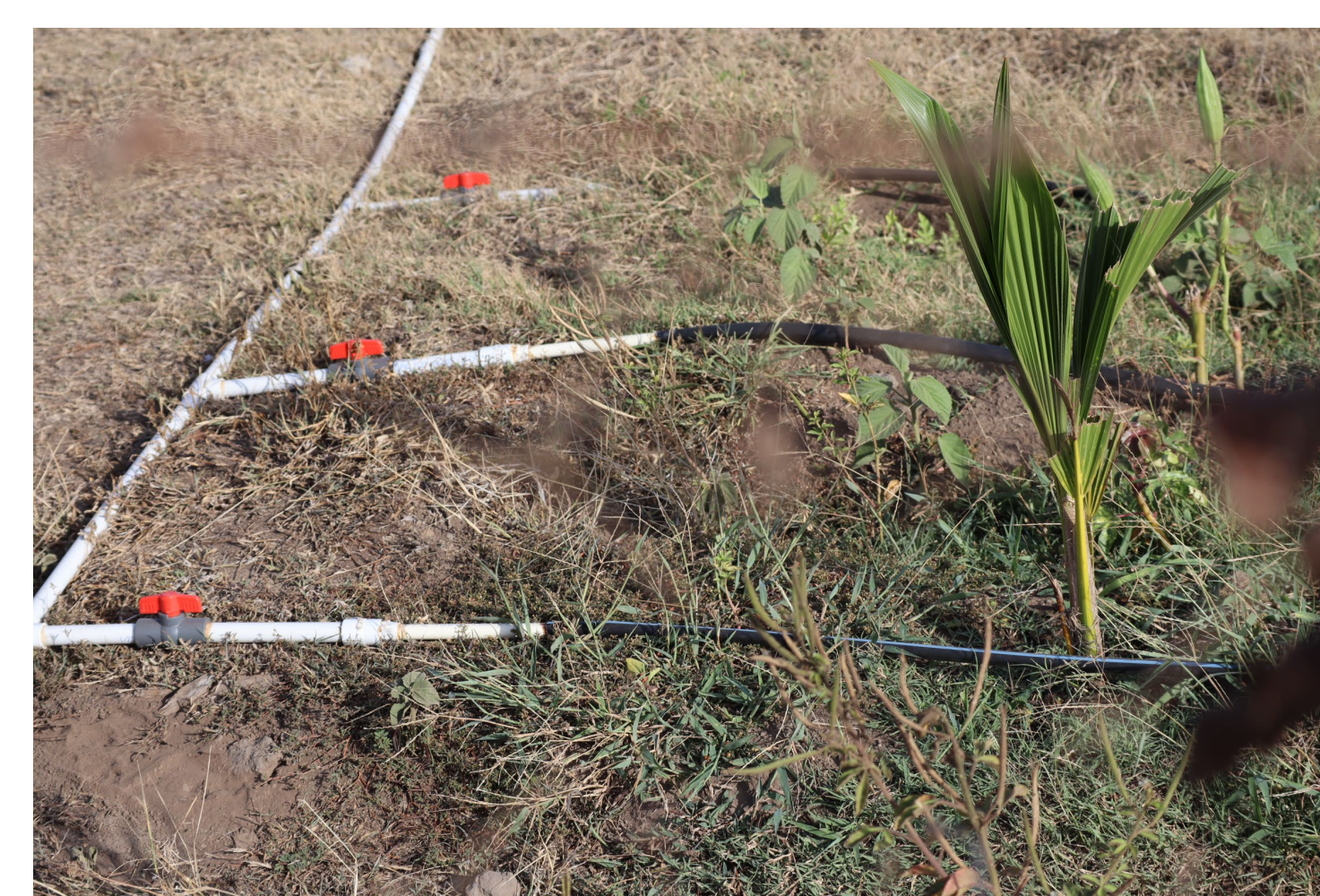
Figure 4. Irrigated food production

In 2023 the opportunities will be further developed including evaluation of the business potential of selected solutions. Using the CANVAS business model approach, it assesses the potential for new nature-inclusive economic businesses pilots.