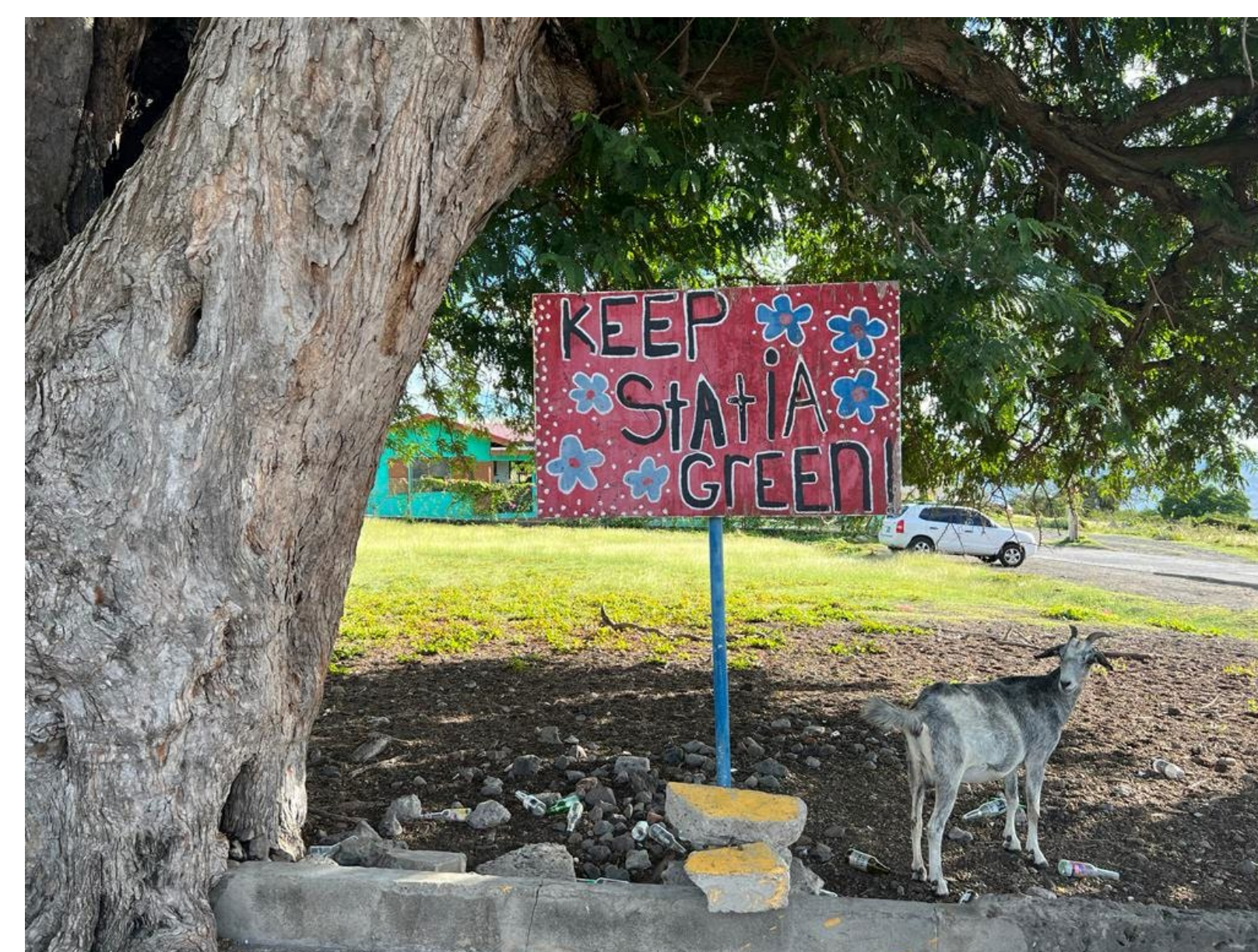
Figure 3. Free roaming animals.