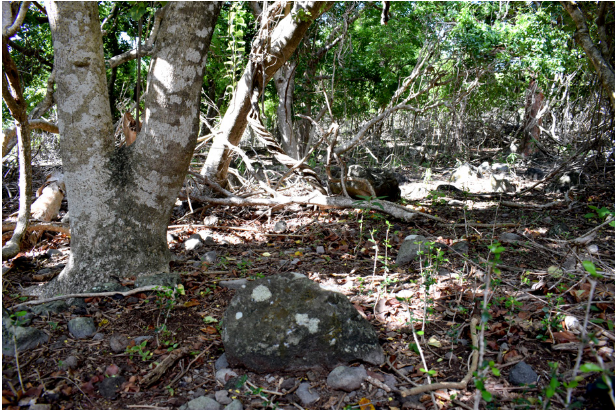
Figure 2. Location of the collected specimen from under the large rock in the foreground. The habitat is dry forest predominantly consisting of water mampoo trees ( Pisonia subcordata ) and several gumbo limbo trees ( Bursera simaruba ). The understory is almost completely denuded of vegetation with the exception of several species unpalatable for free roaming goats and cows on the island.

The first two specimens of Antillotyphlops geotomus were discovered in March 2017, lying next to one another, under the same rock, on the northern side at the foot of the Quill (a dormant volcano), at 78m elevation (17.481160, -62.950965; WGS 84). The third specimen was found and collected in November 2018, under a rock on the southern side of the Quill (17.467331, -62.966736; WGS 84) at 57m elevation. Upon exposure, all snakes attempted to quickly escape by tunneling into the ground. Both locations were characterized by a xeric environment, consisting mainly of larger trees, and sparse understory vegetation (Fig. 2).