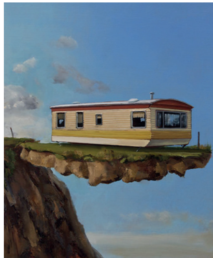
Figure 1 | Caravan Holiday (2010), oil painting by Julian Perry, 31 x 26 cm; reproduced by permission of the artist. The image also appears in ref. 14. Perry's work is presented at www.julianperry.info

The organization Cape Farewell ( www.capefarewell.com ) has shown that artists can engage the public in the climate change debate, not least through its expeditionary activities 4 . Exhibitions such as the Munich Deutsches Museum's Welcome to the Anthropocene 5 have further helped bring climate change into the cultural domain. The very term Anthropocene has “a resonance that goes beyond the modification of a geological classificatory scheme” 6 , and one contribution of the humanities can be to analyse the power of scientific language and narrative. In setting out the challenges