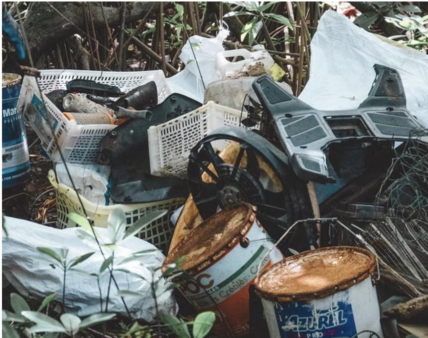
Dumping site before a mangrove clean-up