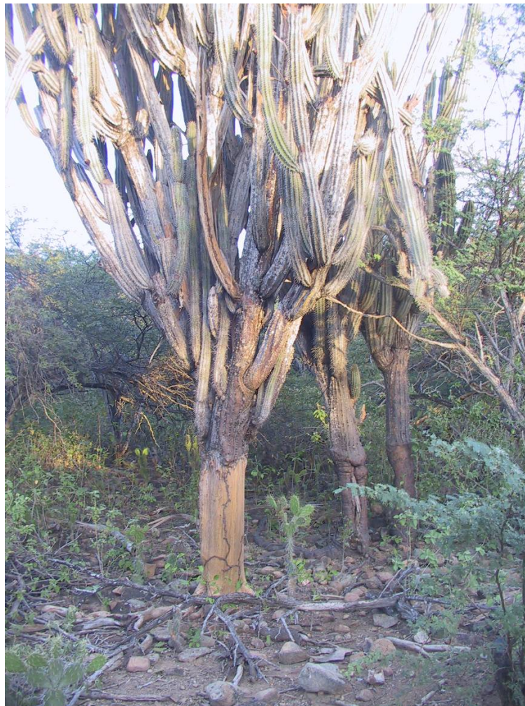
Figure 1. Feral grazers endanger the population of a key-stone food source in the Washington-Slagbaai National Park--by gnawing-off the bark of adult candelabra cacti.

The best perspectives for addressing the overgrazing issue in the Caribbean Netherlands are inside the Washington Slagbaai Park in the section of Slagbaai, which is privately owned and where the park management has full authority to deal with the problem. Preparations have been made for eradication by separating Slagbaai from Washington section with a perimeter fence to prevent goat movement, and experienced volunteers to guide this effort have been identified. A recent review by Staatsbosbeheer stresses the urgent need to address this issue for the park (Blok 2010).