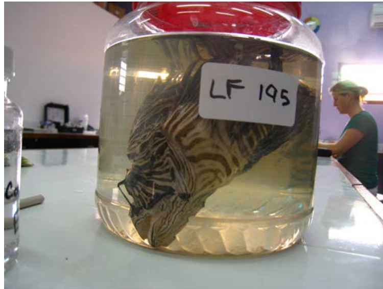
Figure 2. The invasive lionfish has spread through the Caribbean like wildfire.

beyond a few instances (e.g. green mussel). Indeed, a 2003 compilation listed 552 invasive species in the insular Caribbean, only 18 of which were marine (Kairo et al. 2003). However, a more recent survey identified a total of 118 marine invasive species in the Caribbean that included 39 fish and 31 arthropod species (UNEP 2006).