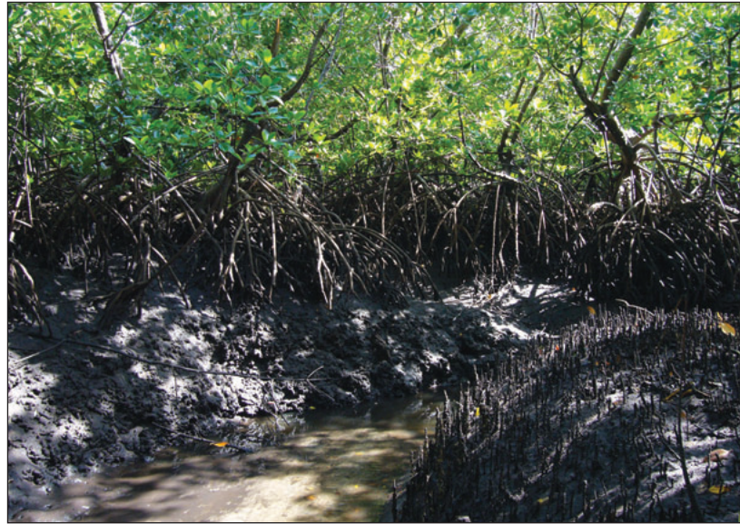
Figure 2. Mangrove forest ( Rhizophora mucronata in the background; pneumatophores of Avicennia marina in the foreground) in Gazi, Kenya. Complex root systems slow down tidal waters and trap carbon-rich particles from the water column and store them in sediment.

The structural complexity of vegetated coastal ecosystems (root systems, dense vegetation, leafy canopy in seagrass systems; Figures 2–4) predisposes salt marshes, mangrove forests, and seagrass beds to be highly efficient in trapping sediment and associated organic C originating from internal and external riverine and oceanic sources (“laterally imported C”). Because vegetated coastal ecosystems can sequester C from both internal and external sources, they represent a C sink for a larger area. Several studies based on stable C-isotope signatures in sediments have demonstrated the importance of the importation and burial of organic C from outside the ecosystem boundaries. An estimated 50% of C sequestered in seagrass meadow sediments is estimated to be of external origin (Kennedy et al. 2010), and for mangroves and salt marshes, cross-system data compilations indicate a full spectrum of situations, from dominance of locally produced C burial to a dominance of laterally imported C sources, depending on, for