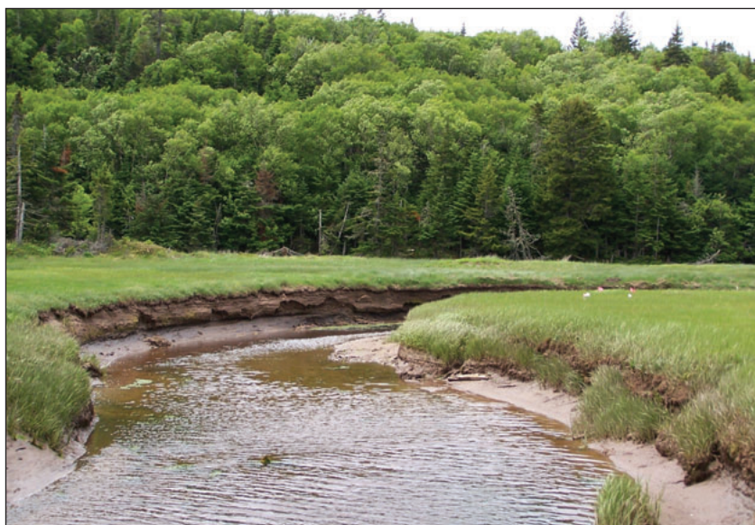
Figure 4. Salt marsh (Dipper Harbour Marsh) in the Bay of Fundy, New Brunswick, Canada. At low tide, greater than 2 m of marsh peat is clearly visible.

spatial variability within mangrove forests, salt marshes, or seagrass meadows other than studies addressing C burial differences among different marsh (Craft 2007) and mangrove habitats (Sanders et al. 2010). Carbon burial rates within a salt marsh or mangrove forest may be affected by variability in hydroperiod, salinity, nutrient status (eg nutrient input from pollution), and suspended sediment supply. Variations in C burial capacity is linked to changes in allocation among plant parts (eg roots versus leaves), decomposition, and primary productivity, which are in turn driven by both physical (eg temperature, precipitation, sea level, nutrients, sediment type) and biological (eg species composition, plant competition, herbivory, bioturbation, trophic cascades) variables.