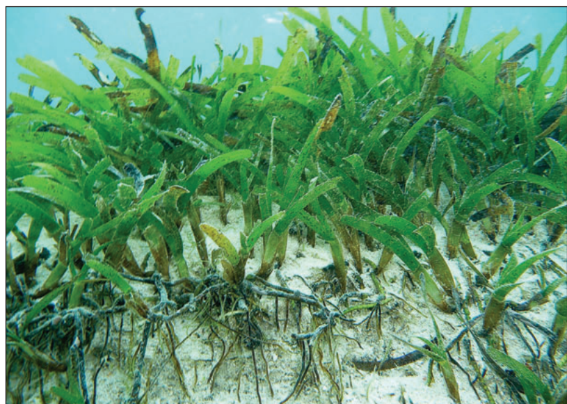
Figure 3. Shallow seagrass meadow ( Cymodocea serrulata ) in Zanzibar, Tanzania. Roots and rhizomes trap and store sediments and associated organic carbon.

Estimates of the long-term C burial capacity in blue carbon sinks are highly variable. There are no definitive studies of