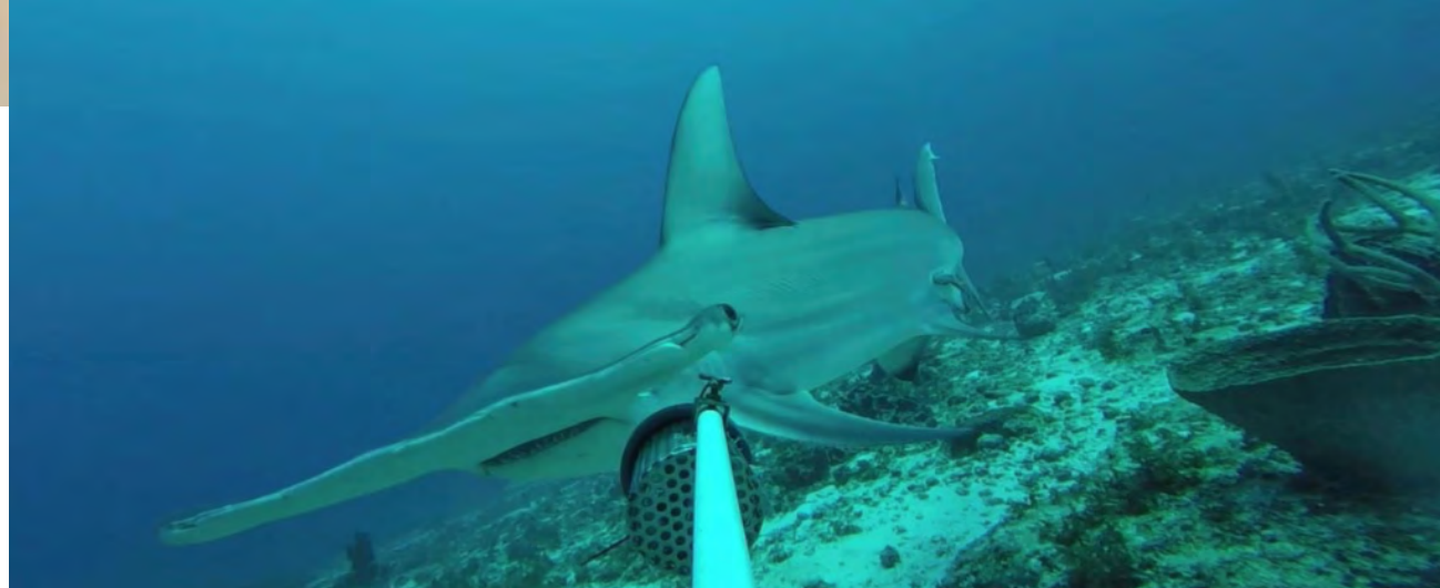
BRUV deployment on Bonaire.