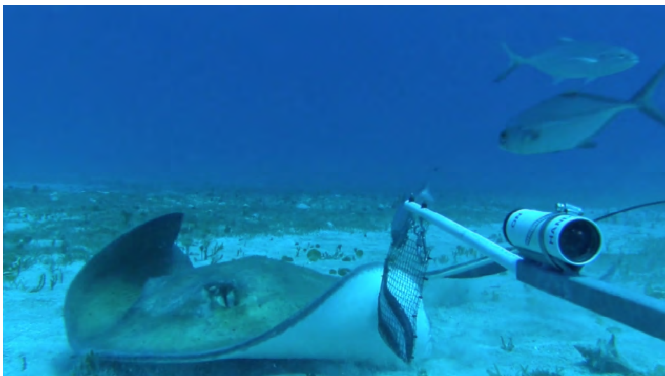
Sharks and Rays of the Caribbean